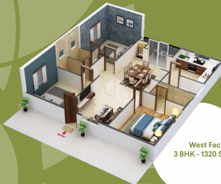
West Facing 3 BHK - 1320 SFT