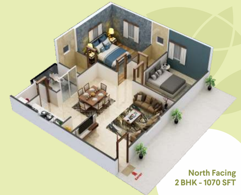
North Facing 2 BHK - 1070 SFT