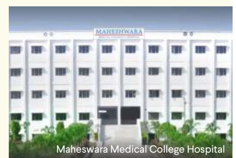
Maheswara Medical College Hospital