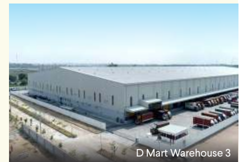
D Mart Warehouse 3