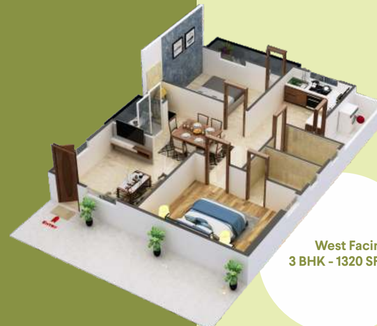
West Facing 3 BHK - 1320 SFT