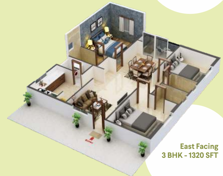
East Facing 3 BHK - 1320 SFT