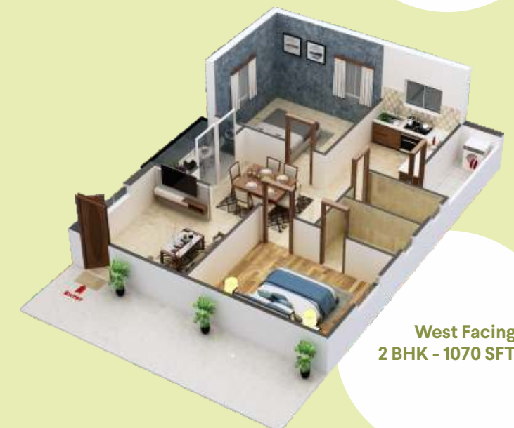
West Facing 2 BHK - 1070 SFT