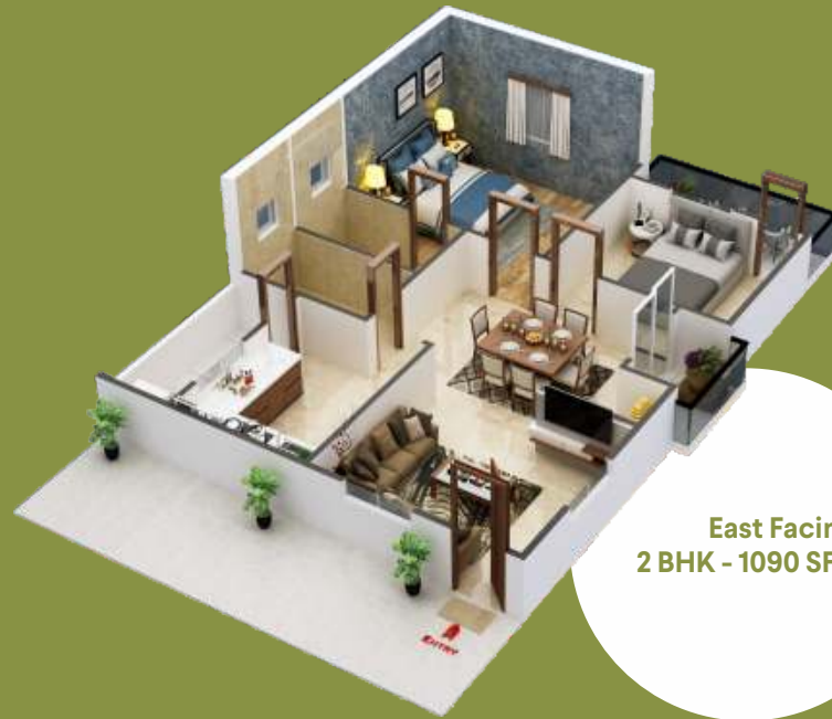
East Facing 2 BHK - 1090 SFT