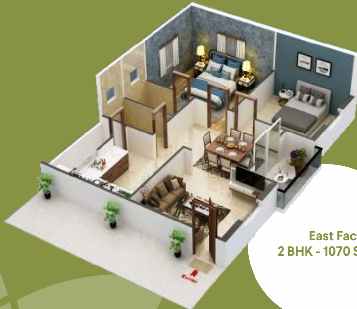
East Facing 2 BHK - 1070 SFT