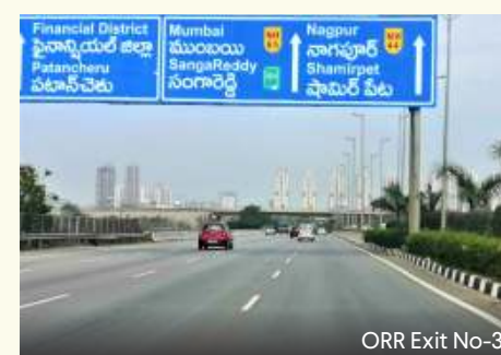
ORR Exit No-3