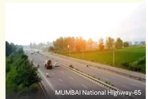
MUMBAI National Highway-65